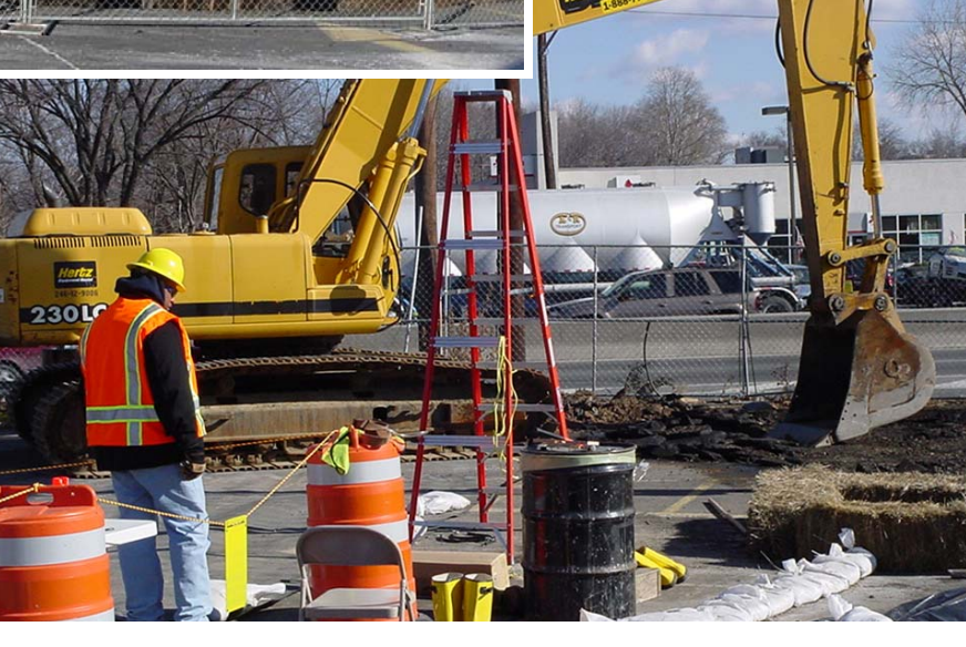
An Army Corps project engineer looks over an excavation site in Maywood. New Jersey Route 17 is in the background.

Soil removal underway at 113 Essex Street, Maywood. The safety fence prevents unauthorized access into the construction zone, and is one of many measures in place to protect the health and safety of workers and the public.