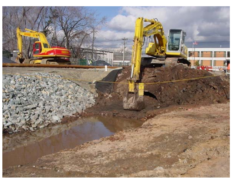
Excavation at an open drainage channel on the Essex Street, Lodi property.

hese cleanups, or removal actions, were authorized by the Army Corps in November 2001 after a mandated regulatory and public review and comment process. In March 2002, the Corps successfully completed cleanup of a commercial property on Route 46 in Lodi under this same authority. Eleven properties at the Maywood Site are eligible for removal actions under this authorization. Cleanup decisions for the remaining site properties will be outlined in a Record of Decision document (see page 3).