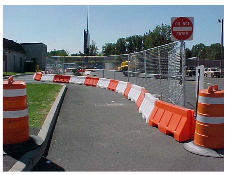
A well-marked and protected walkway adjacent to a Corps work site ensures pedestrian safety.